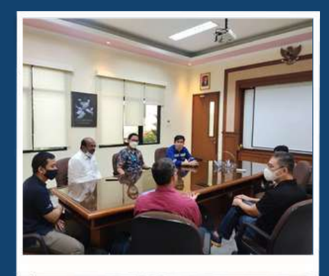
Every project we've completed involved all of our engineers to reduce errors

Our dedication and sincerity to continuing to build knowledge, which guarantees services that are in line with the expectations of customers.